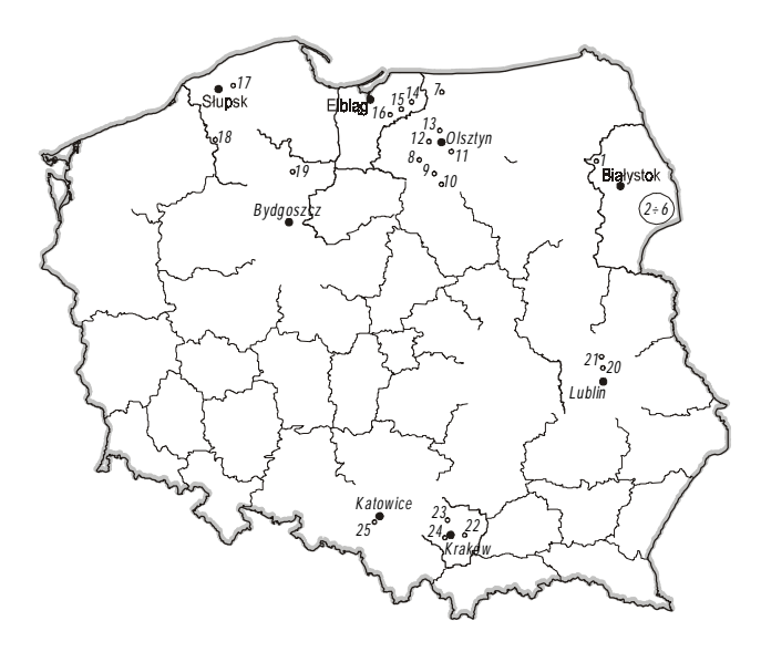
Figure 1. Location of sites surveyed in Poland.